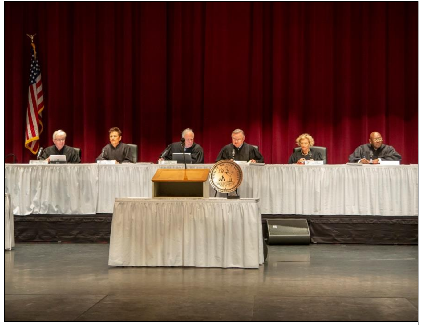
The Supreme Court of Illinois holds oral arguments at Lewis and Clark Community College.

The Supreme Court has held oral arguments in other locations in Illinois to raise awareness of the judicial branch and of the important role the court system has in interpreting state laws. This outreach into various communities in Illinois has been a tremendous success, particularly with high school students, who gain a better understanding of state civics and the role of the judiciary in interpreting laws. In the past, the Court has met at Mt. Vernon in 2008, Ottawa in 2014, Lisle in 2016, and Champaign in 2018. During the September 2019 Term of the Supreme Court, the justices heard oral arguments while "traveling the circuit" in Godfrey, Illinois on the campus of Lewis and Clark Community College. Nearly 600 people attended the arguments, the majority of which came from thirteen high schools in the Metro East St. Louis area. The Commission assisted the Court with site selection, logistics, program booklets, and providing background material for students and teachers.